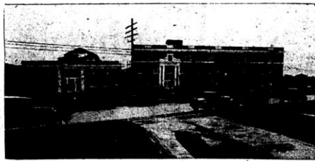
Exterior View of Attractive Building Housing Tri-State Hospital One of the most commodious hospital buildings in this section. 125 patients' private, three major operating rooms, and many other notable facilities are installed in this modern institution.